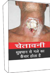
Front of pack