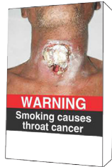
Back of pack

India's HWL size tied for 2nd in the WHO South-East Asia Region and tied for 3rd globally in 2016. 1 India meets FCTC guidelines for warning size on the front and back of the pack.