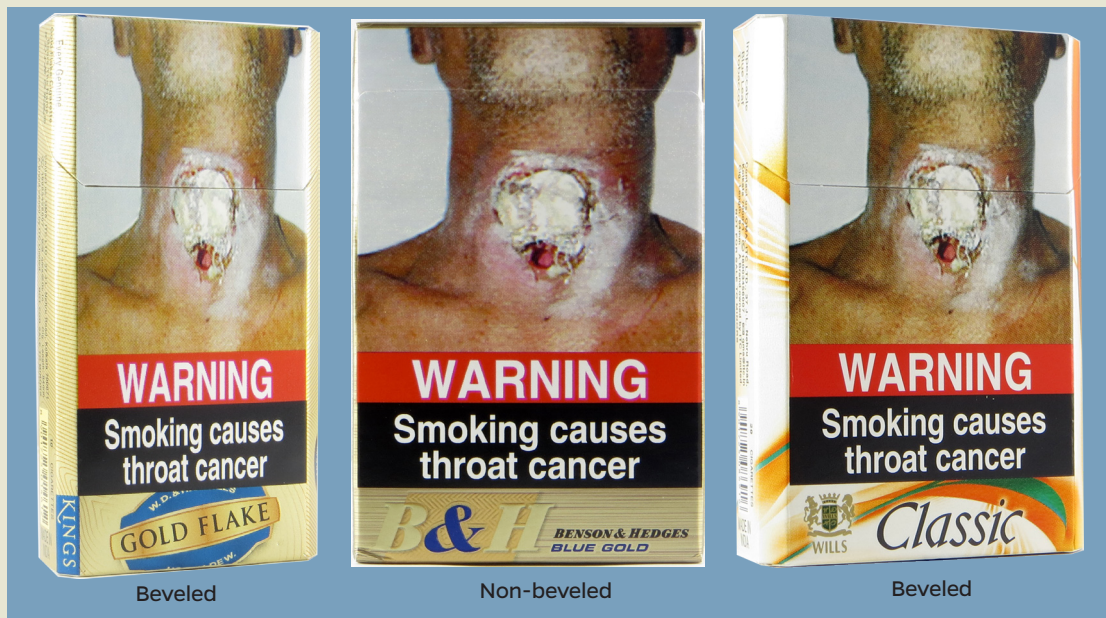
Collected packs with beveled and non-beveled edges

These packs are compliant with the four key HWL requirements. However, the presence of beveled edges reduces the available space of the principal display area for the HWL. This introduces additional areas for branding on the front and rear faces of the package, potentially minimizing the impact of the HWL.