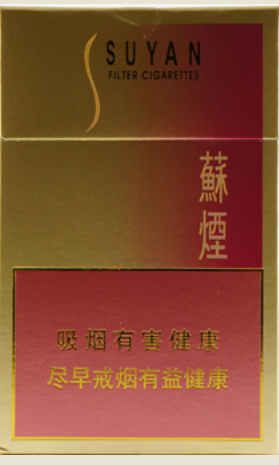
Branding around HWL