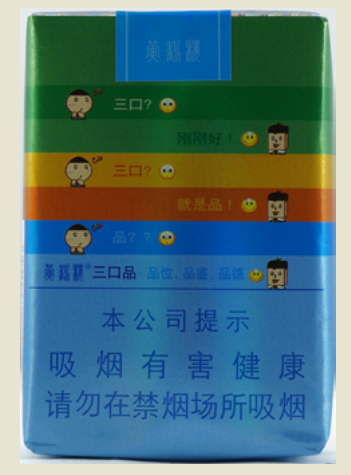
Low contrast text and background