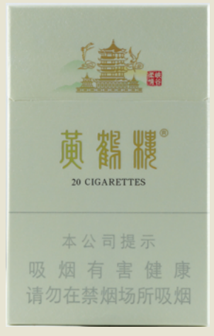
Low contrast text and background

China's law requires HWLs to be positioned at the bottom of the pack and have text that contrasts with the background. Due to the ability for manufacturers to select the colors of the HWL, labels can be integrated into the packaging design, rather than being displayed prominently. These packs demonstrate how packaging design can influence the prominence of HWLs.